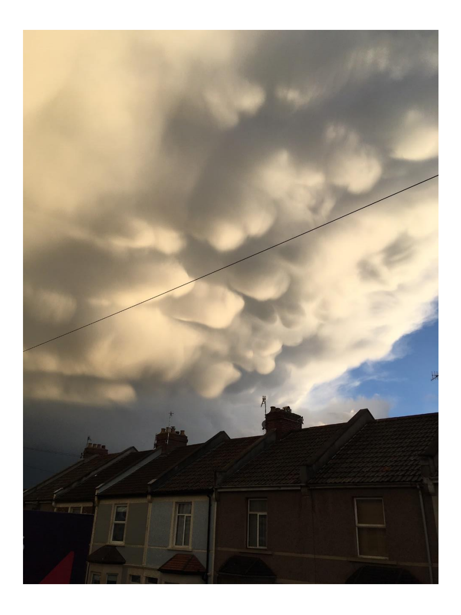
Er... Is that a face? In the clouds?! Spooky. What's going on here — an alien invasion perhaps, or a weird storm the likes of which has never been seen before? Is something supernatural afoot? What might the people in the houses below be thinking? Write down your ideas whenever you're ready.